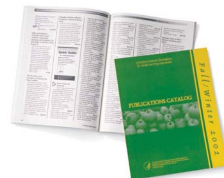
Print digital jobs that your competition can't.